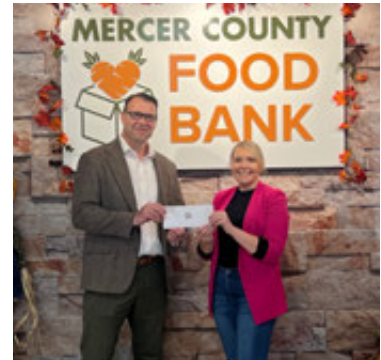
Laurel Technical Institute - Gigi's Table