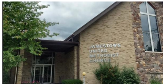
Jamestown United Methodist Church, Jamestown