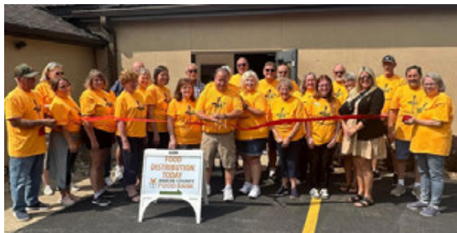
Gentle Shepherd of the Nazarene, Hermitage

From Sharon to Jamestown and all across Mercer County, we work together to fight food insecurity.