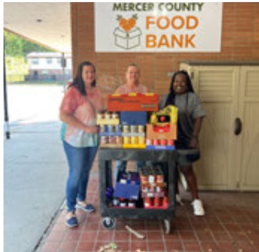
First National Bank