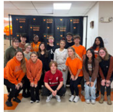
BC3 Linden Pointe - eAcademy