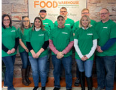
Mercer County State Bank