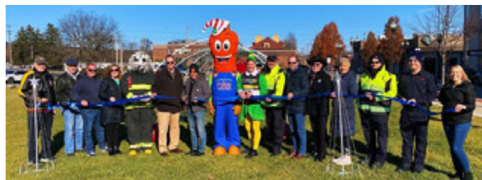
City of Sharon Small Business Saturday