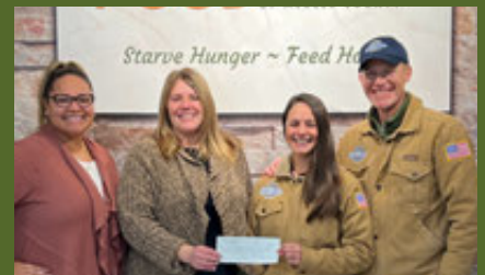
Gerasimek Tree & Stump Removal