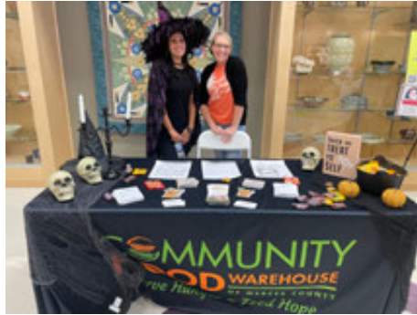
HopeCat Monster Mash