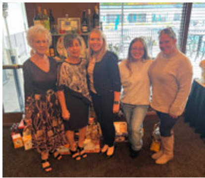
Quota of Hermitage Bring Your Own Game and Style Show Fundraiser