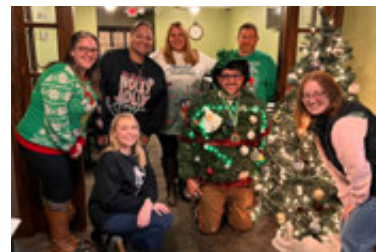
Staff Christmas Party