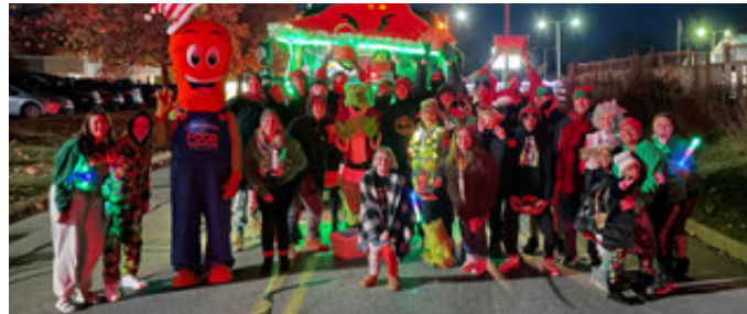
City of Hermitage Light up Night Parade (Joined by Hickory High School Boys Basketball Team)