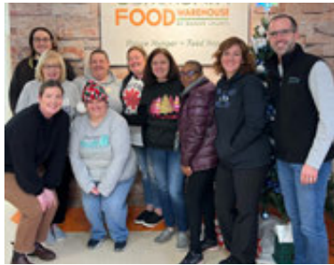
Primary Health Network