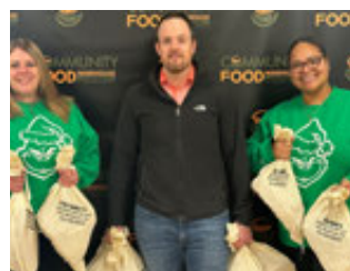
Diversified Family Services