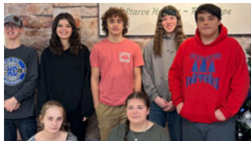
West Middlesex High School Family & Consumer Science Class