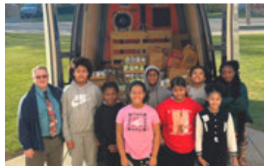
Farrell Elementary School

MLK said it best "Life's most persistent and urgent question is: "What are we doing for others?" Thank you to the various businesses and organizations who answered that question and provided the means for MCFB to continue meeting the growing need for food assistance throughout the County.