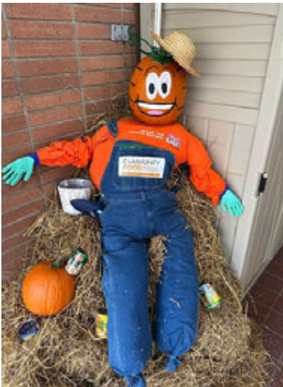
Myron the Carrot Pumpkin decked out for the City of Sharon Scarecrow Contest

A huge thank you to both the City of Sharon and the City of Hermitage for allowing MCFB to join in the holiday fun. MCFB had the opportunity to participate in the City of Hermitage's Light up Night Parade and the City of Sharon's Scarecrow and Holiday Window Display contests. MCFB also joined in the ribbon cutting for Small Business Saturday in Sharon. THANK YOU to all who took the time to vote we captured third in both contests!