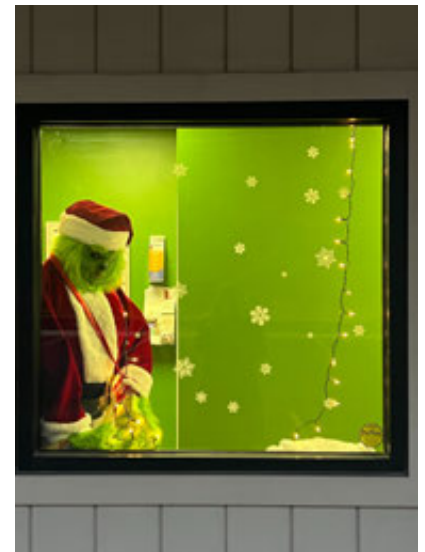
City of Sharon Holiday Window Contest