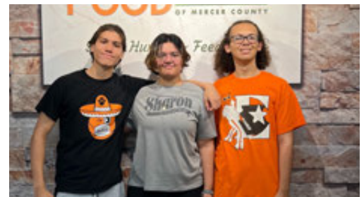
Sharon High School Interact Club