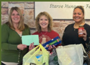
Buhl Community Band