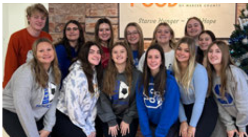
Sharpville High School Teens that Care Club