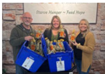
Hunters Sharing the Harvest