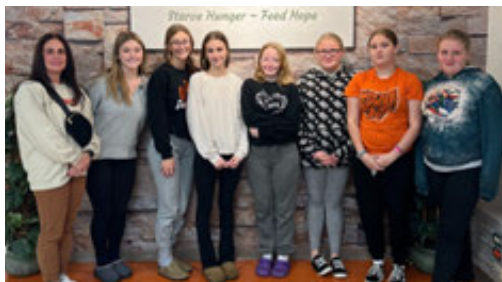
Sharon Middle School Students for Charity