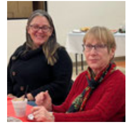
Coffee, Cocoa, and Cookies with Volunteers