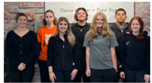
Sharon High School Spanish Club