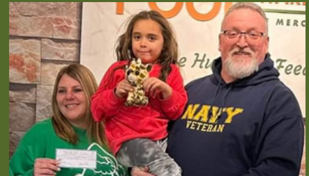
Shenango Valley Charitable Fund