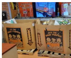
West Hill Elementary