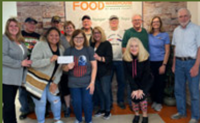
Shenango Valley Corvette Club

Special thank you goes out to the following organizations and businesses who stopped in throughout the months of November and December to show their support of our various programs.