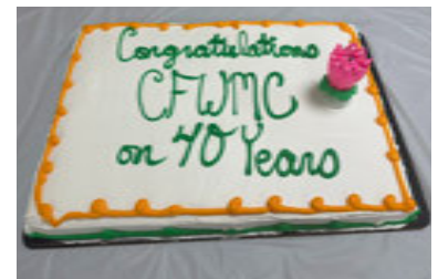
40th Anniversary Cake