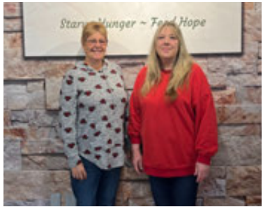
Seven Seas Pools & Spas